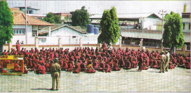
850ಕ್ಕೂ ಹೆಚ್ಚು ಲಾಮಾಗಳು ದೇವಾ ಪಿರಿಯಾಪಟ್ಟಣದ ಬೈಲುಕುಪ್ಪೆ ಟಿಬೆಟಿಯನ್ ಕ್ಯಾಂಪಿನ ಸೆರಲಾಚಿ ದೇವಾಲಯದಲ್ಲಿನಡೆದ ಲಯದೆ ಬಳಗೆ ಪ್ರಾರ್ಥನೆ ನಡಸಿದರು. ಹೊಸವರ್ಚಾಚರಣೆಯ ಪೂಜೆಯಲ್ಲಿ ಪೌಮ್ರಖಾನ್ ಪಂಗಡದವರಿಗೆ ದೇವಾಲಯ ಪ್ರವೇಶ ನಿಷೇಧಿಸಿದ ಆದರೆ ಬಹಿಷ್ಯಶ ಪೌಮ್ರಖಾನ್ ಹಿನ್ನೆಲೆಯಲ್ಲಿ ಪ್ರಾರ್ಥನೆ ಸಲ್ಲಿಸಿದರು.

ಸರಾಮ ಮತ್ತು ಸೆರಾಜಿ ಧರ್ಮಕಾಲೆ ಪಂಗಡವನ್ನು ಸಾಮಾಜಿಕವಾಗಿ ಗಳಿಂದ ಪೌಮ್ರ ಖಾನ್ ಪಂಗಡ ಬಿಹಿಷ್ಟರಿಸಿದ್ದಾರೆ. ಅಲ್ಲಸಂಖ್ಯಾತರಾಗಿ ದವರನ್ನು ಬಹಿಷ್ಕಾರ ಹಾಕಿದಂತಾಗಿದೆ.